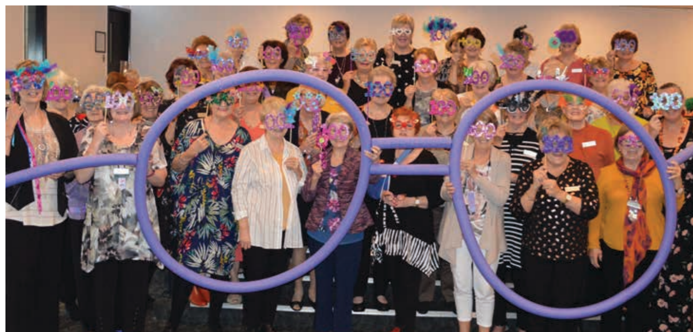
Best Group - Carindale VIEW Club (QLD)