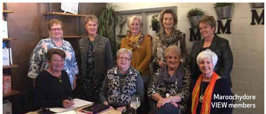
Maroochydore VIEW members

On the day members would normally meet, the committee sent out an email transporting them virtually to the event. The emails described the room and the beautiful table settings, the warm welcome from hosts, the tasty lunch and even included a 'celebrity guest' speaker.