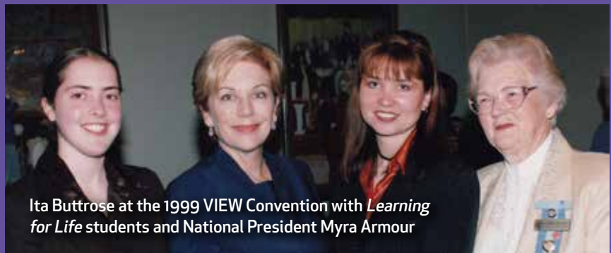
Ita Buttrose at the 1999 VIEW Convention with Learning for Life students and National President Myra Armour