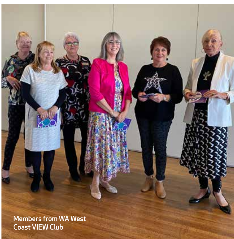
Members from WA West Coast VIEW Club