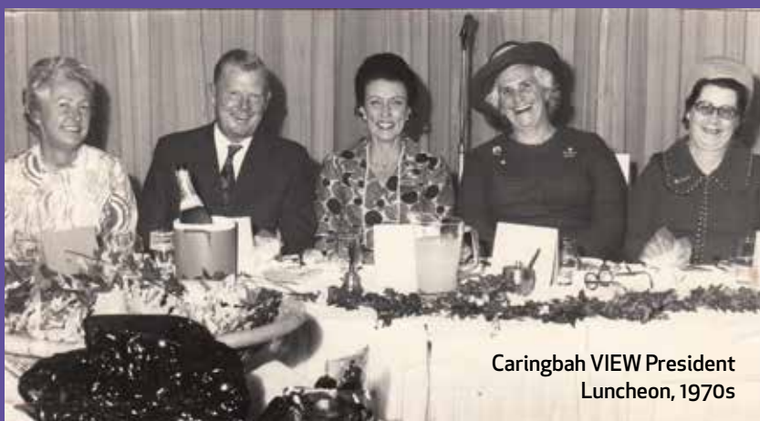
Caringbah VIEW President Luncheon, 1970s

Congratulations and thank you to all the clubs celebrating 60 years of dedication to making a difference to disadvantaged students and their families through The Smith Family.