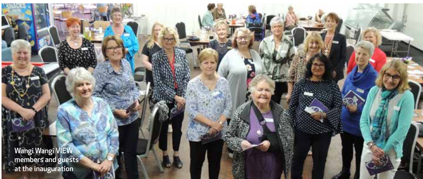
Wangi Wangi VIEW members and guests at the inauguration