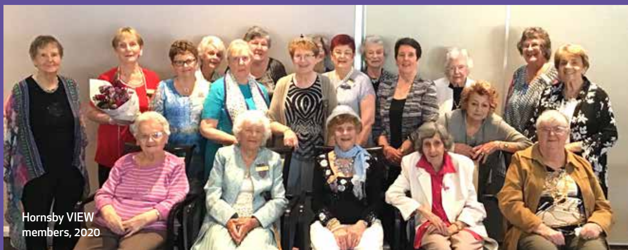
Hornsby VIEW members, 2020