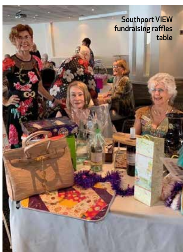
Southport VIEW fundraising raffles table

Today, thousands of disadvantaged students have access to long-term educational support thanks to VIEW's commitment to The Smith Family's Learning for Life program. VIEW is The Smith Family's largest community sponsor of Learning for Life students, currently sponsoring 1,448 students across primary, secondary and tertiary levels.