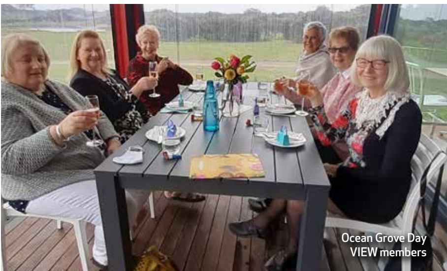
Ocean Grove Day VIEW members

1970s, she has attended three Conventions and helped members celebrate 50 years of VIEW. She fully supported VIEW's role in the Jumbly sale, and this year was set to appear at our cancelled Diamond Jubilee High Tea 60th Anniversary celebration.