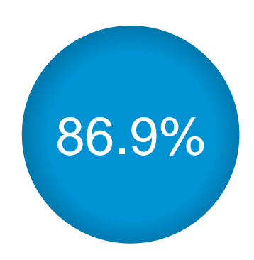
For Learning for Life secondary school students

These are 2014 figures and there has been steady year on year improvement for all three rates since 2012