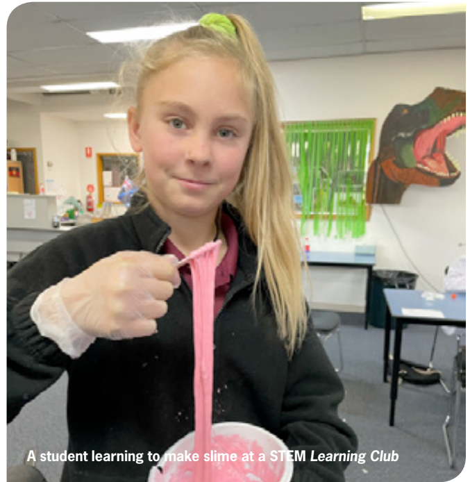
A student learning to make slime at a STEM Learning Club

These out-of-school Learning Clubs are run by teams of dedicated volunteers and a paid team member. They would not be possible without your generous donations so thank you!