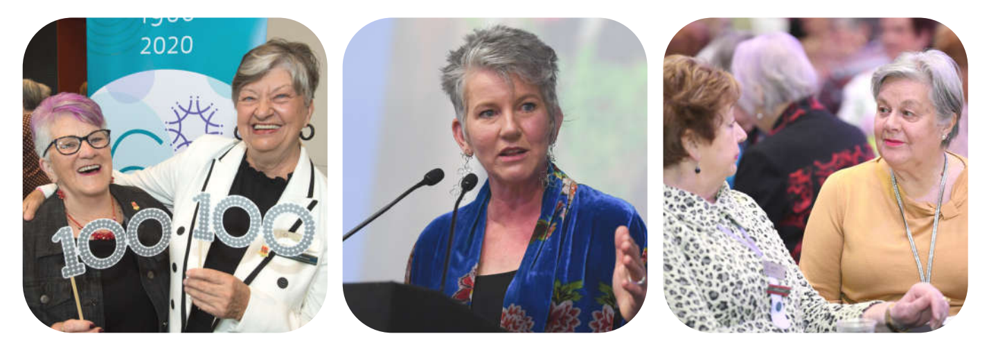
These photos were taken at VIEW National Convention in Adelaide 2022.

Price includes: Buffet lunch with tea/coffee and orange juice