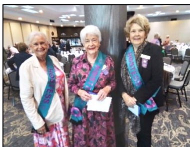
A busy time for our Hostesses & Trading Table ladies.