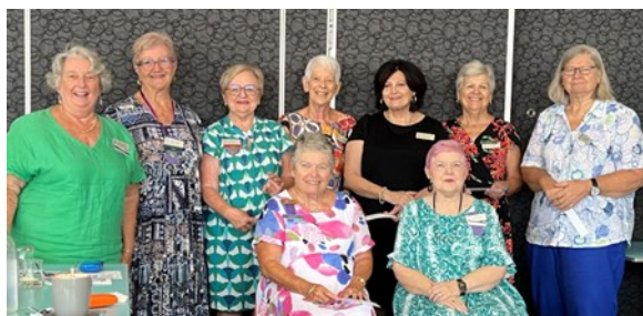
Some of our 2025 Committee members