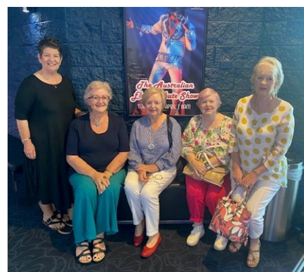
Some of our members enjoyed an Elvis tribute

Email: Redcliffview@gmail.com Website: www.view.org.au