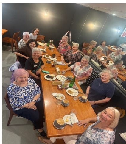
Coffee and Chat at Basil's at Scarborough