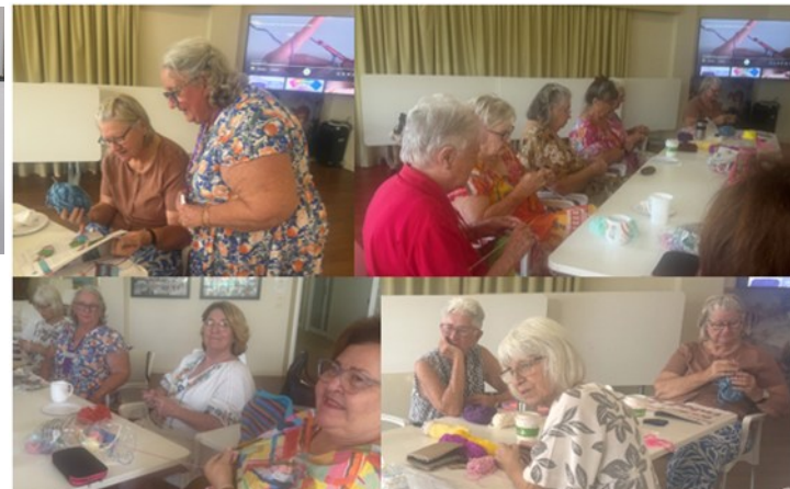
Some of our ladies teaching and learning about crochet at our Craft Morning .