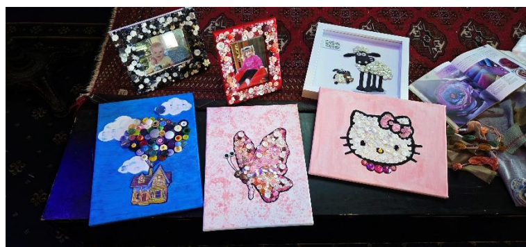
↑ Beautiful display of craft from our ladies in the Craft and Wellbeing Group. →