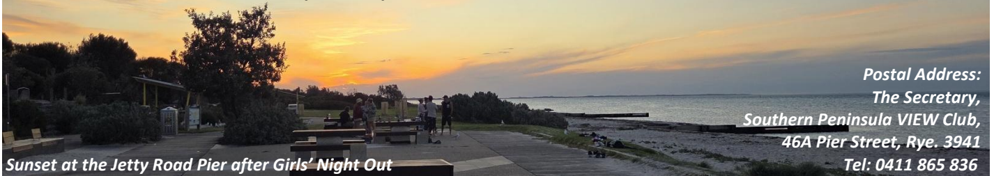
Sunset at the Jetty Road Pier after Girls' Night Out