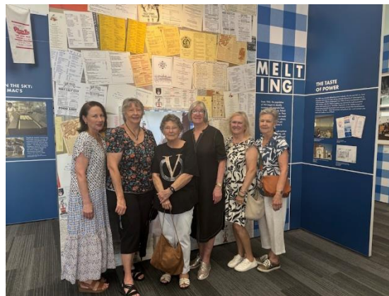
Our club outing for March to the State Library exhibition on W.A's food history.