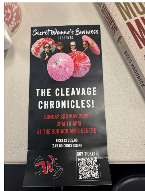
Something to put in the diary. Celia's friend is performing in "The Cleavage Chronicles" at the Subiaco Arts Centre on Sunday 3rd May at 2 -4 pm. Tickets $55 Concession $4