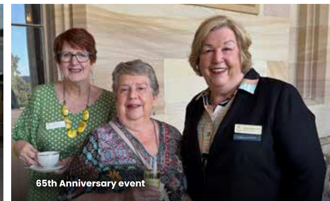
65th Anniversary event