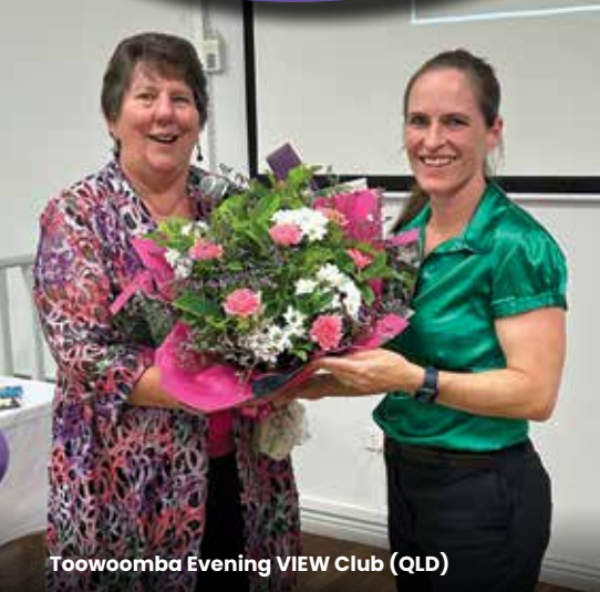
Toowoomba Evening VIEW Club (QLD)