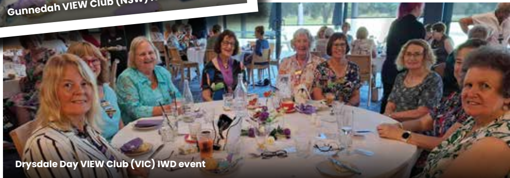
Drysdale Day VIEW Club (VIC) IWD event