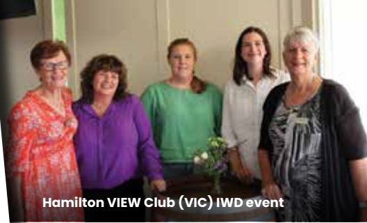
Hamilton VIEW Club (VIC) IWD event