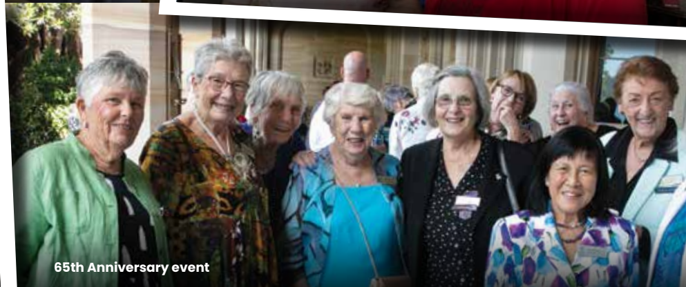
65th Anniversary event