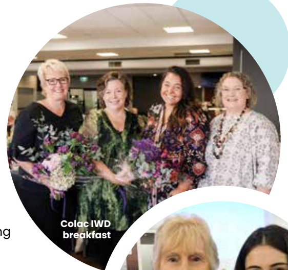
Colac IWD breakfast

This confident young woman had the audience spellbound.