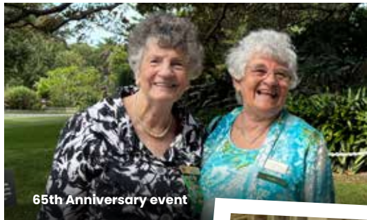
65th Anniversary event