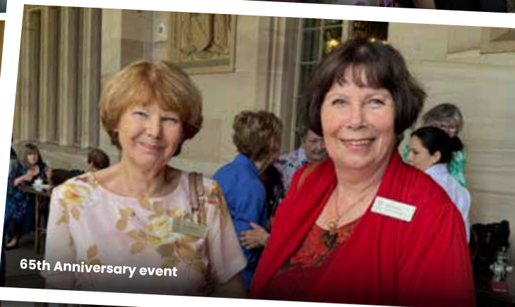
65th Anniversary event