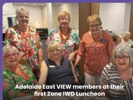
Adelaide East VIEW members at their first Zone IWD Luncheon

and an inspiring writer, director, and producer.