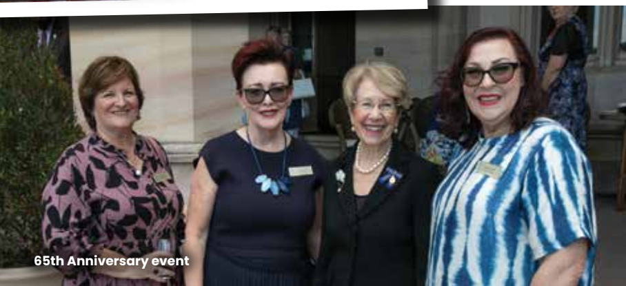
65th Anniversary event