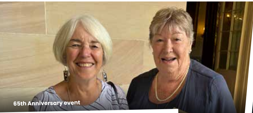
65th Anniversary event