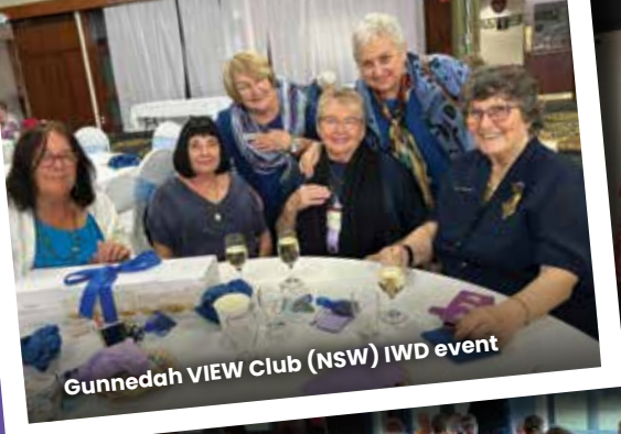
Gunnedah VIEW Club (NSW) IWD event