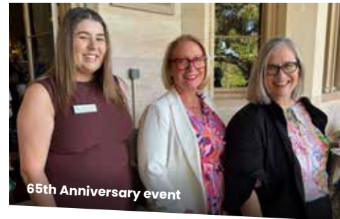
65th Anniversary event