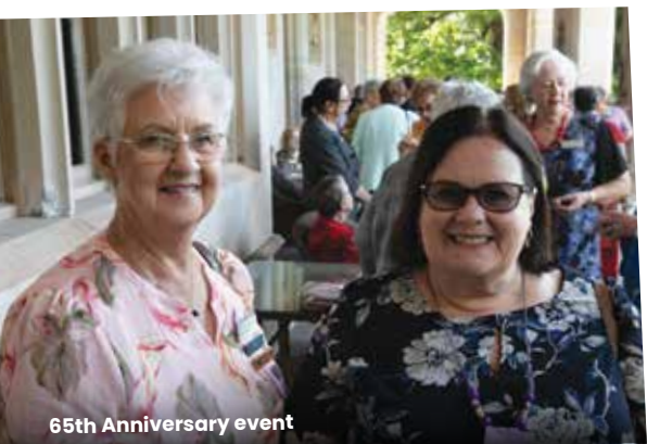
65th Anniversary event