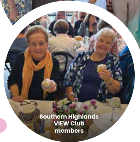
Southern Highlands VIEW Club members