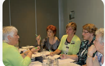
Discussing motions for Resolution at the February National Council.