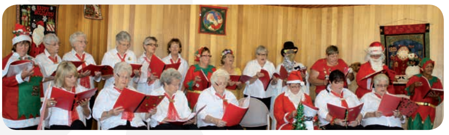
The Mudgee VIEW Club Singers, pictured here at the Christmas luncheon, entertain on special occasions.

The club's main fundraising activity is a monthly Street Raffle where VIEW members get out in the community to sell raffle tickets and talk about the work VIEW does to support The Smith Family. This initiative, combined with other major raffles held for Mother's Day and Father's Day, enables the club to raise enough funds to sponsor one Learning for Life student and make a generous annual donation to The Smith Family. Cobar VIEW Club is grateful for the support it receives from local businesses who generously donate prizes for all raffles enabling more proceeds to go directly to supporting disadvantaged students.